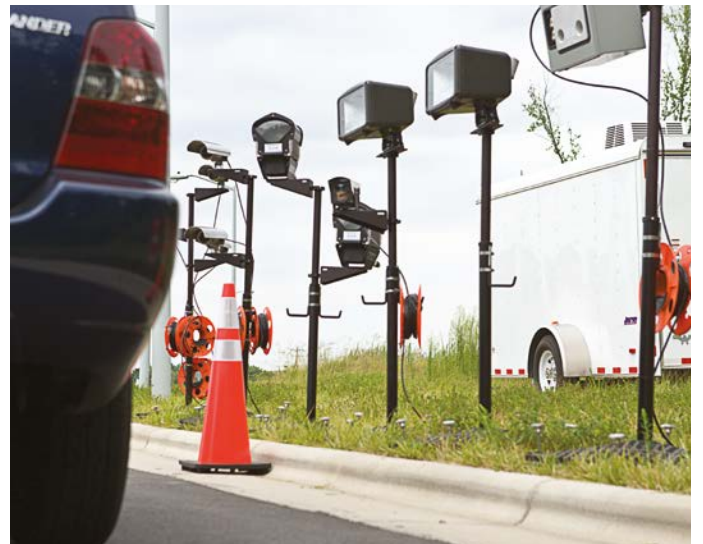
Mobile ELSAG border checkpoint

Every plate number is instantaneously compared to white lists or hot lists, and when a suspect vehicle is identified, alarms are broadcast in real time to a command center and to officers' in-car computers, for immediate interdiction.