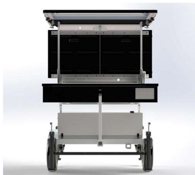
SpeedAlert 24 radar message sign on 380 ALPR camera-ready trailer with camera enclosure box.

Trailers are compatible with InstAlert variable message signs and SpeedAlert radar message signs so you can share messages, reduce speeding, or collect traffic data while covertly capturing license plates.