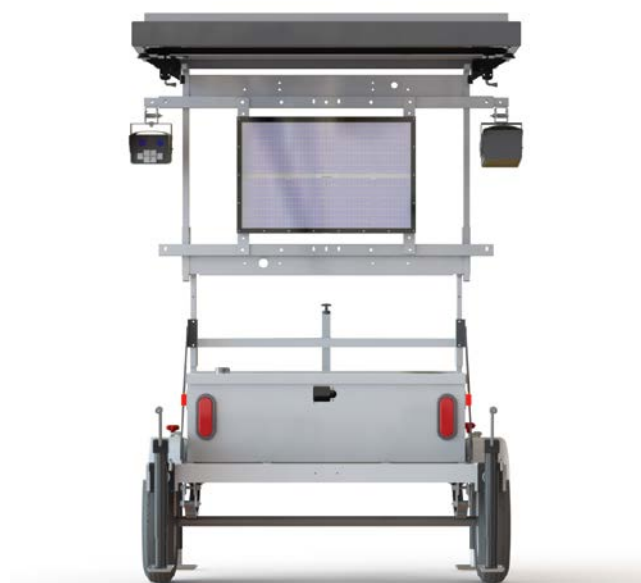
SpeedAlert 18 radar message sign on 380 ALPR camera-ready trailer with camera mounting bar.