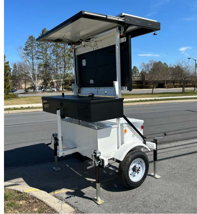
SpeedAlert 24 radar message sign on 380 ALPR camera-ready trailer with covert camera enclosure Box.

ATS proudly stand behind our trailers and signs with US-based tech support, complimentary one-on-one product trainings, and the best warranty plans on the market, so you get the most out of your purchase for years to come.